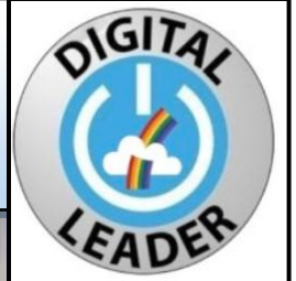
Digital Leaders hosted an assembly to share with the children their important role in school.