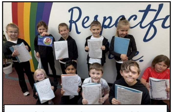
One of the Year 2 phonics groups did some fantastic writing.