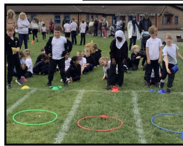
We had the first few sports days!