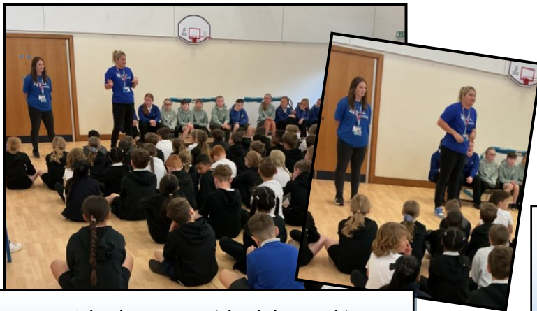
KS2 had an assembly delivered by representatives from Teesside Mind.