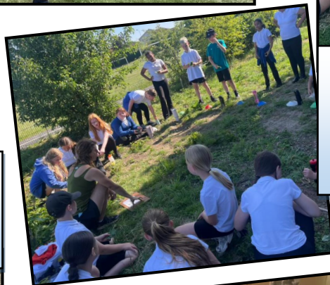
Our Year 2 children went on a trip to Captain Cook's Birthplace Museum.