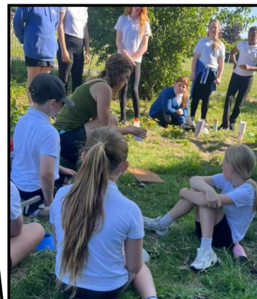
Year 6 did leaf printing in their Forest School session.