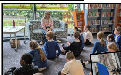
One Year 5 class visited the Ingleby library and Tesco as part of the Farm to Fork scheme.