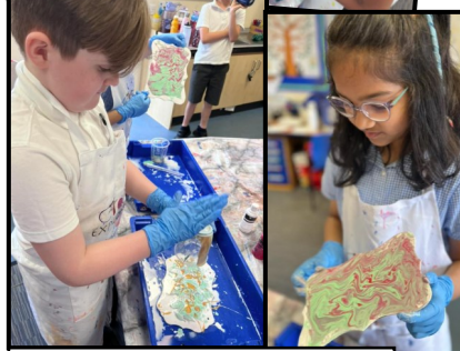
Year 3 with their messy, but fun, art!