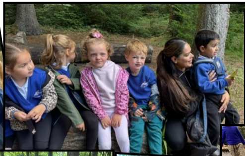
Our Reception classes went on a trip to Hardwick Park.