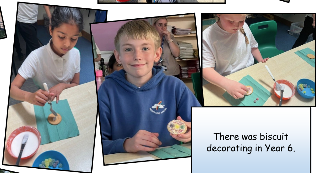
There was biscuit decorating in Year 6.