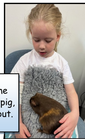
We had animal time and our new guinea-pig, Fern, made her debut.