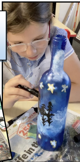
Crafty Explorers have been glass painting.