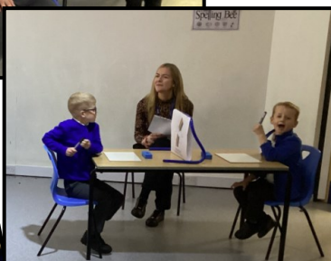
We hosted the Trust Spelling Bee and came 4th.