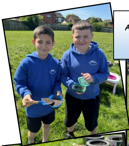
A new OPAL zone - the Dig Zone - opened this week.