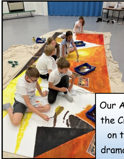
Our Art Ambassadors and some of the Crafty Explorers worked hard on the scenery for the school's drama club production of 'Joseph'.