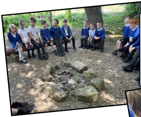
Year 2 had a Forest School session and ate marshmallows!