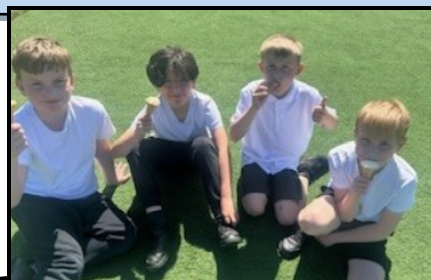
Friends of Whinstone held their Ice Cream Friday.