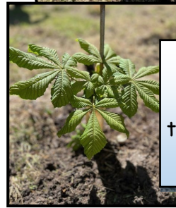
One of our pupils planted a very young Horse Chestnut tree which he has grown from a conker.