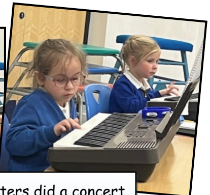
Music Monsters did a concert for their parents and Y3 and Y4.