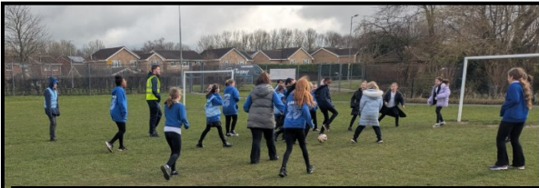
We had our first 'Girls' Football Friday'.