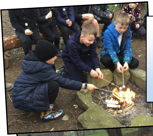
Year 4 had a Forest School instructor come in and work with them in our newly renovated Wildlife area.