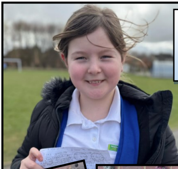
More OPAL fun.