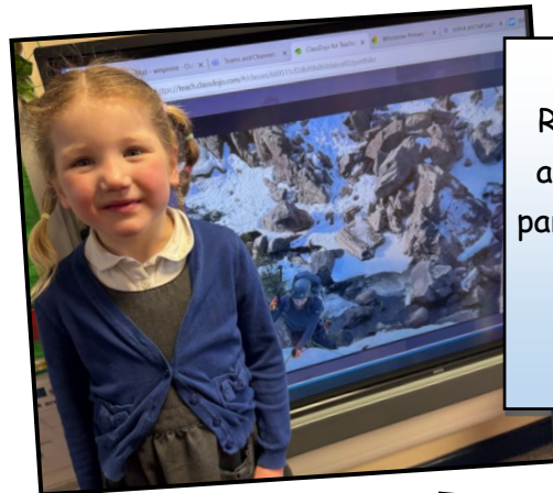
Reception heard about one of our parents who like to climb ice waterfalls!