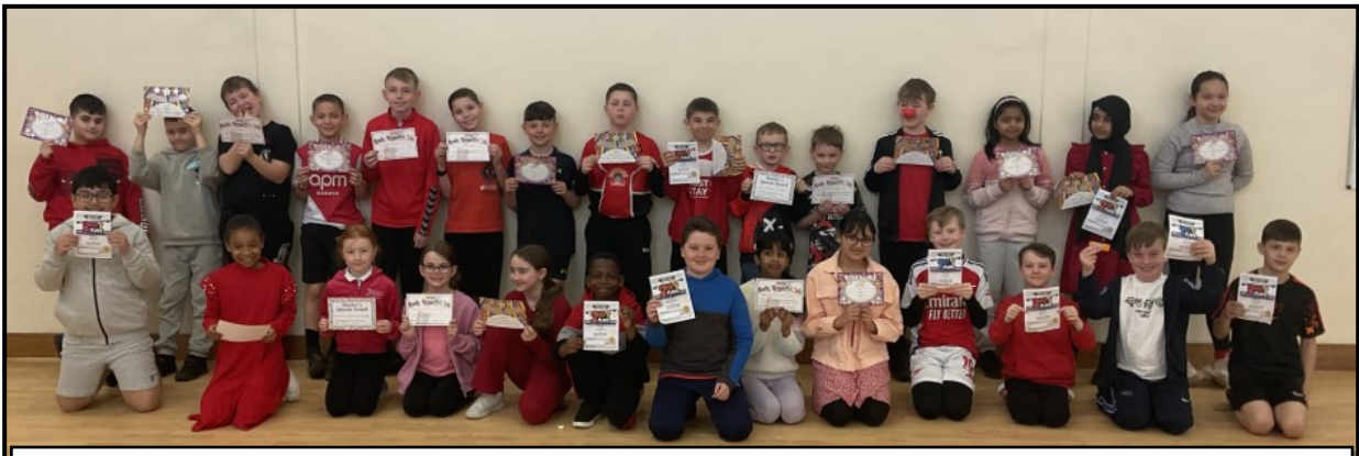
Our KS2 certificate winners this week. They are also in their Red Nose Day attire!