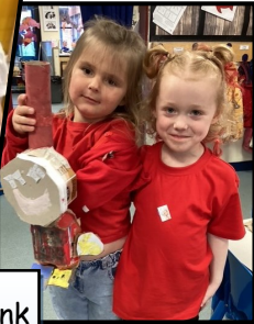
Our Reception children used junk modelling to create their own animal.