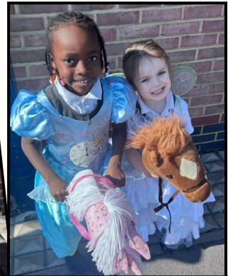
OPAL (Outdoor Play and Learning) time!